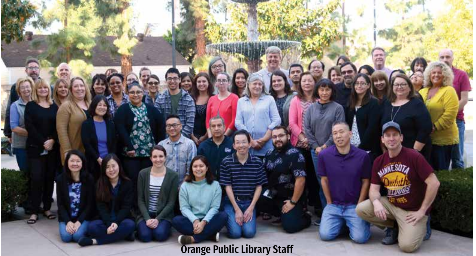
Orange Public Library Staff

700 people every week get the right answer from OPL’s librarians